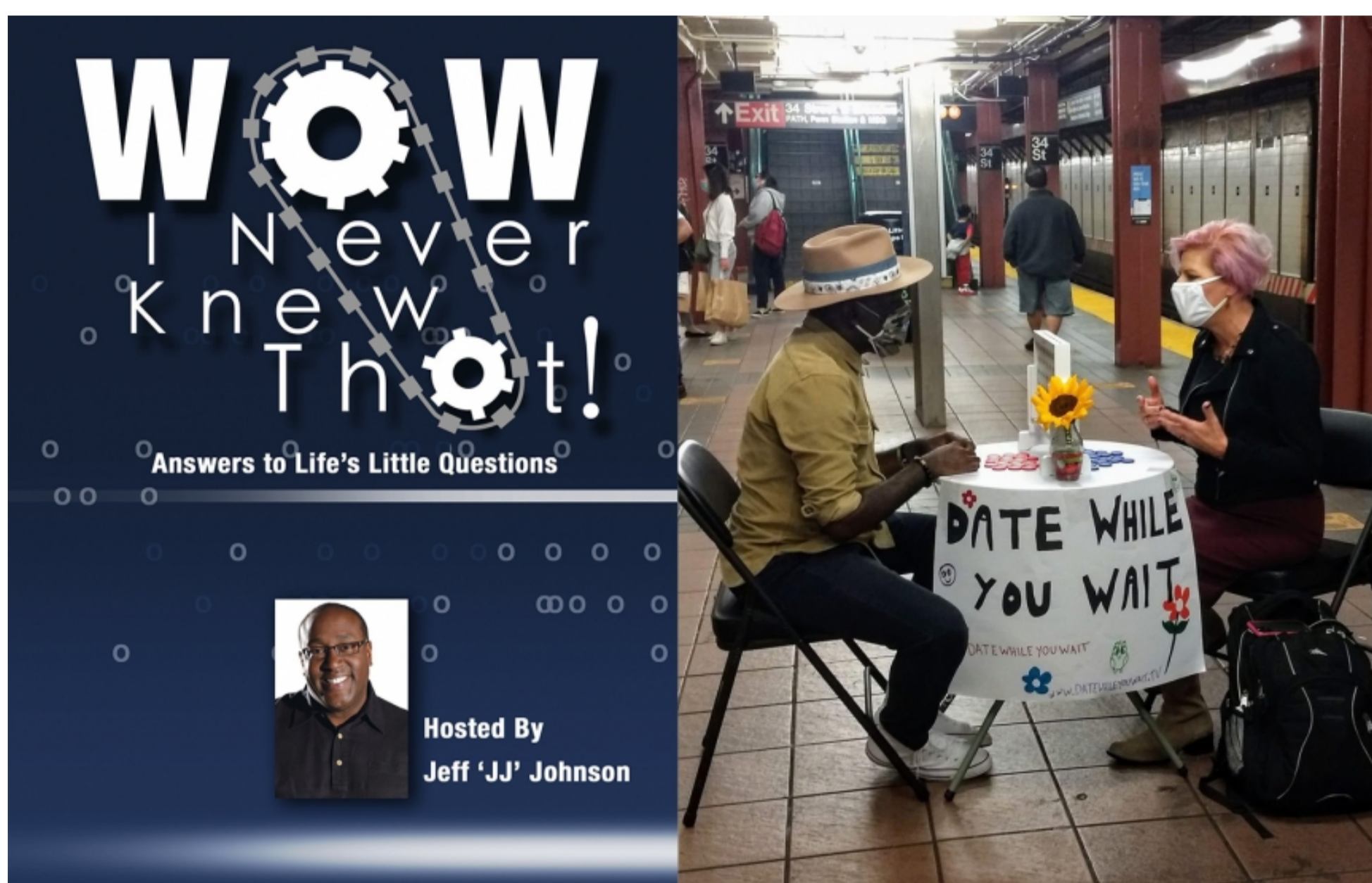
"Wow, I Never Knew That" and "Date While You Wait"

Emmy awardwinning production and distribution company is showing "Date While You Wait" which was produced during the pandemic and the new series "Wow, I Never Knew That".